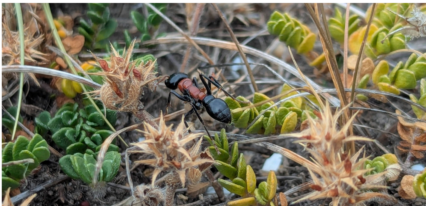
Myrmecia nobilis foraging in an open area