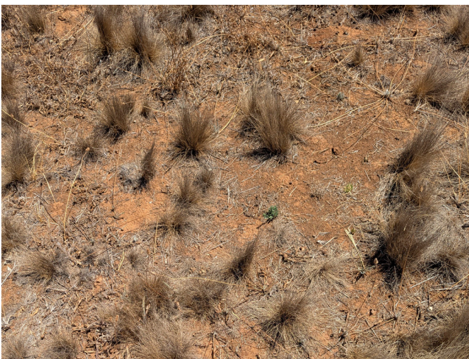
Figure 1e: Eastern Moorabool site