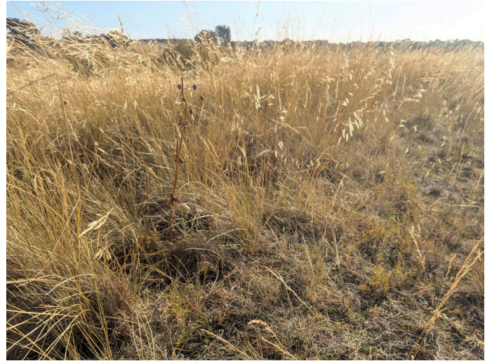
Figure 1b: Hobsons Bay site