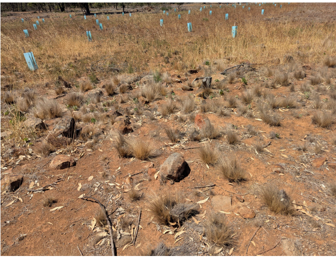
Figure 4: Large areas around the nest at the eastern Moorabool site are seemingly devoid of most resources that would be expected of a vegetatively diverse landscape (Ian Smith)

As such it is unclear what role, if any, vegetative diversity plays on M. nobilis food resources.