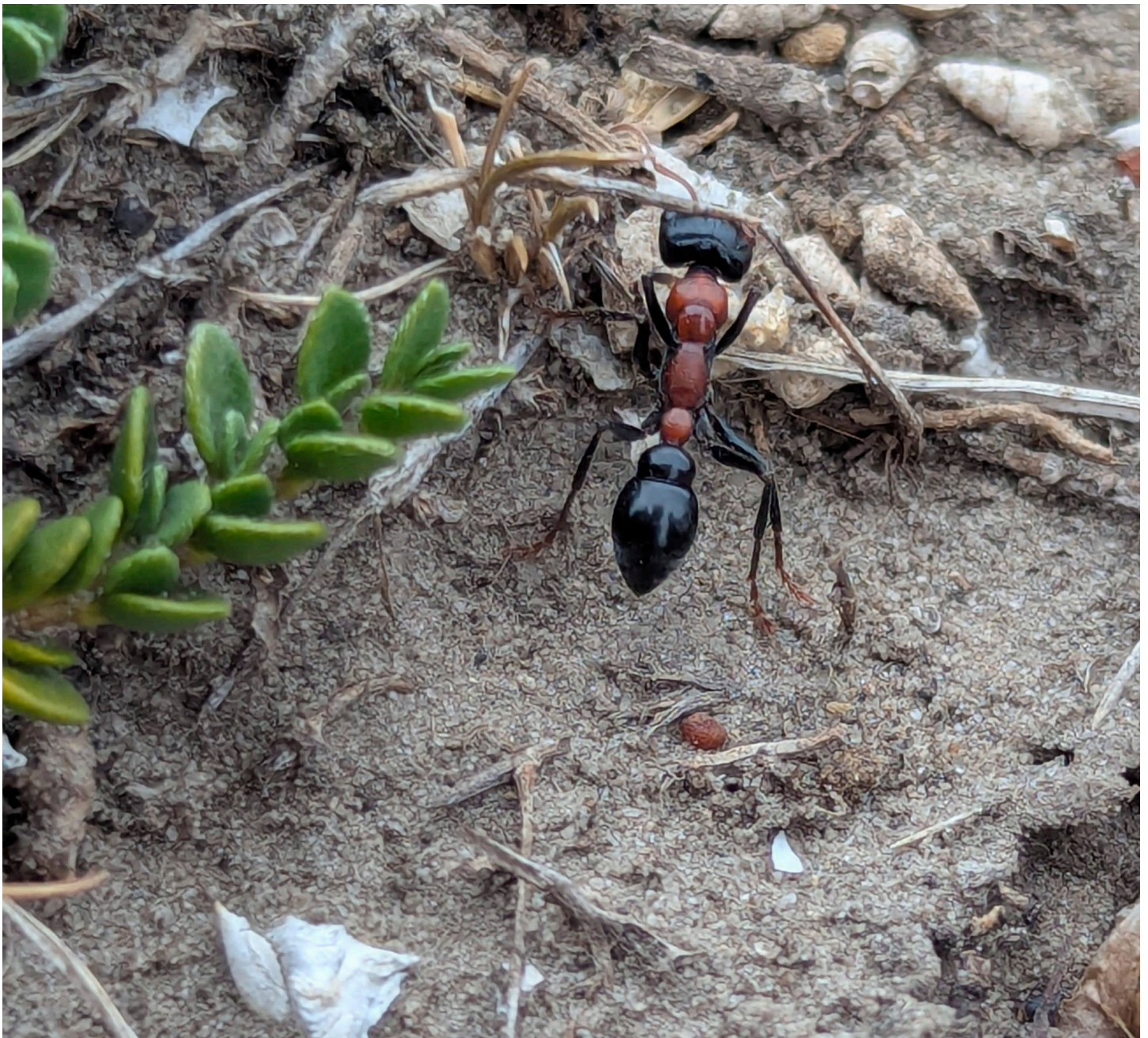
Myrmecia nobilis