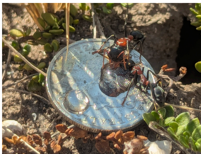
Figure 3. Myrmecia nobilis enjoying a sugar solution (Ian Smith)