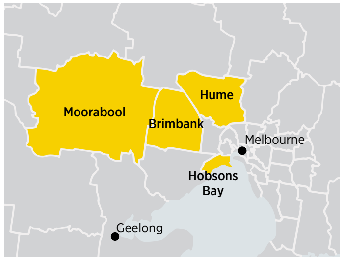
Figure 1f: Location of municipalities