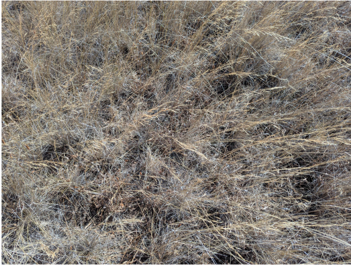
Figure 1a: Brimbank site