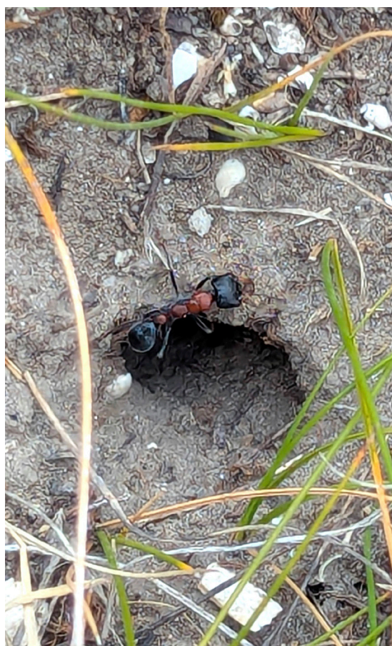
Myrmecia nobilis entering a nest