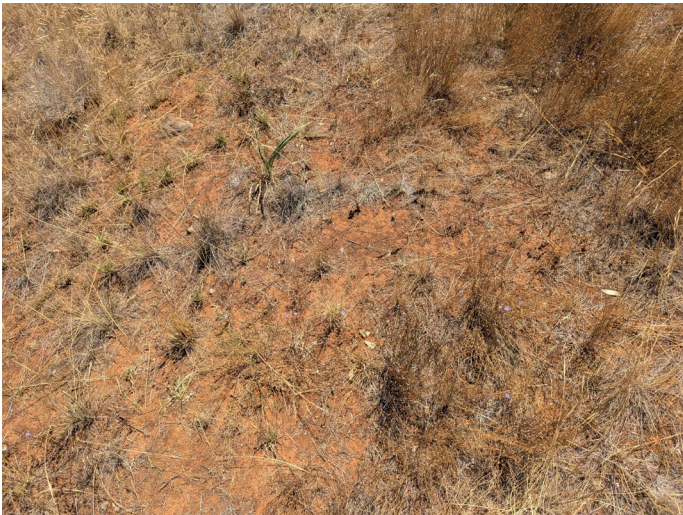
Figure 1c: Western Moorabool site