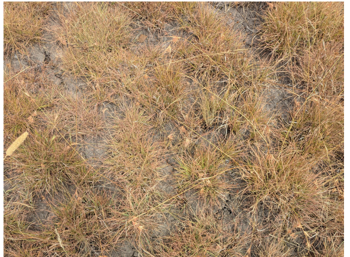
Figure 1d: Hume site