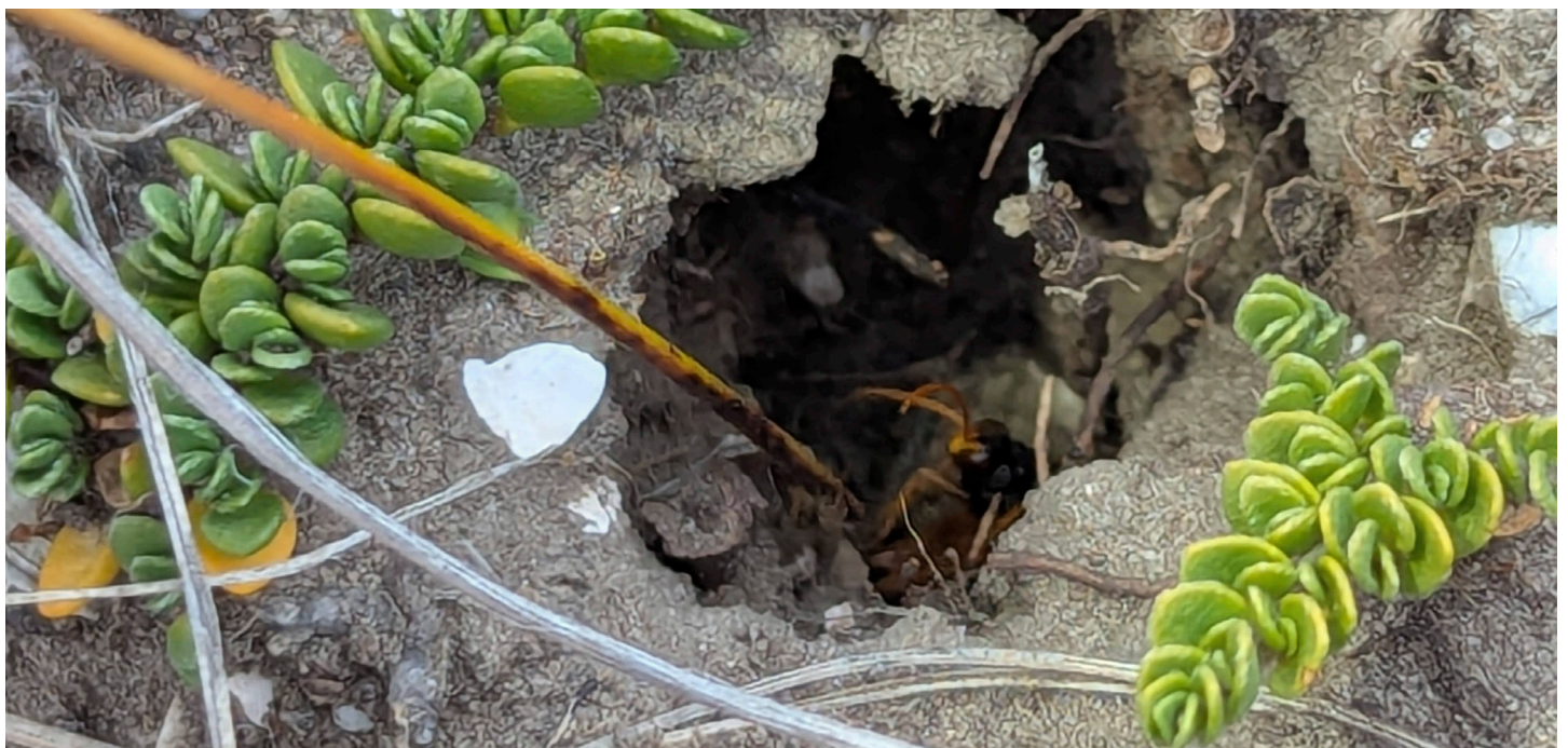
Entrance to a Myrmecia nobilis nest (Ian Smith)