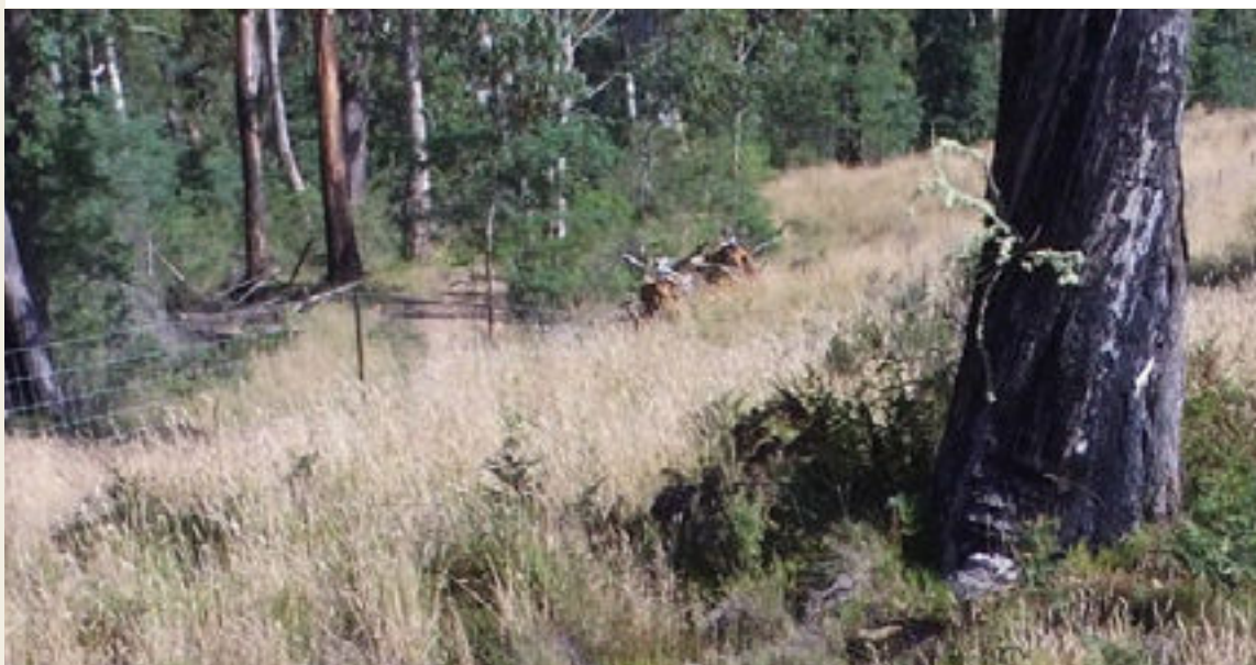
Deer proof fence, struggling seedlings and thick grass cover. February 2021

The logging coupe has not been finalised and was categorised as 'current regen' in the December 2020 TRP. In February 2021 it was mostly thick grassland surrounded by a deer-proof fence with occasional struggling seedlings.