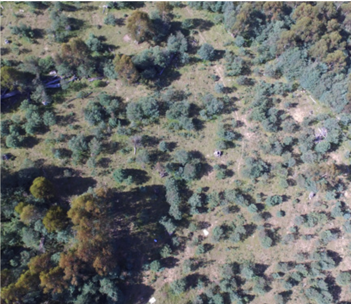
Some eucalypts are regrowing (yellow-green) but large areas are covered with grass and weeds or dominated by acacia (grey-green). The two white sheets (centre bottom) are 25 metres apart.

Images from Google Earth show large areas devoid of trees in 2016. In February 2021 we found well-established stands of acacia, some eucalypt regeneration and extensive areas of grass and weeds. Horse tracks and droppings were everywhere.