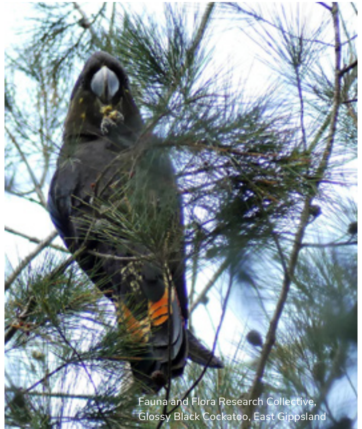
Fauna and Flora Research Collective, Glossy Black Cockatoo, East Gippsland

In the 1990s, the Commonwealth and several state governments signed Regional Forest Agreements (RFAs) that entrenched logging as a permanent feature of state forest management and gave native forest logging conducted in accordance with an RFA a unique exemption from federal environment laws. The RFAs were always controversial, and the conflict continues today, intensifying as logging reaches into forests once thought too precious to lose or too difficult to reach. In Victoria, the state logging agency, VicForests, is now in the unprecedented position of defending nine separate community-initiated court cases. One case is headed for appeal to the High Court.