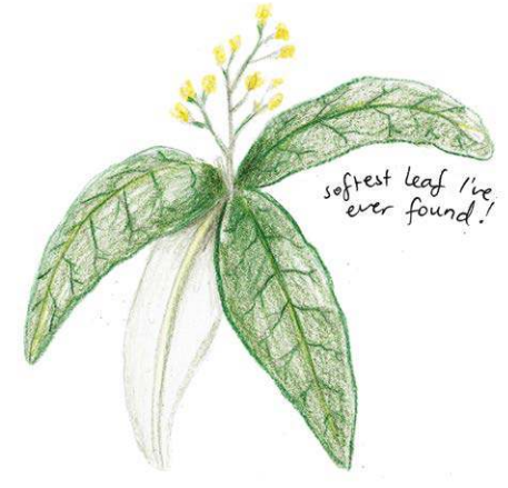
"Blanket Leaf" Bedfordia arborescens

Leaves from the bush are used by wildlife for all sorts of things. They can be used for food, nests, a place to lay eggs, warmth and shelter.