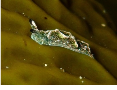
Elysia furvacuada (NS) (1 sighting)