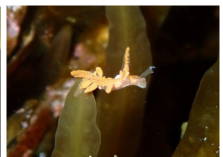
Hermaea sp. RB10 (NS) (1 sighting)