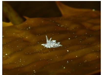
Janolus sp. RB2 (NS) (1 sighting)