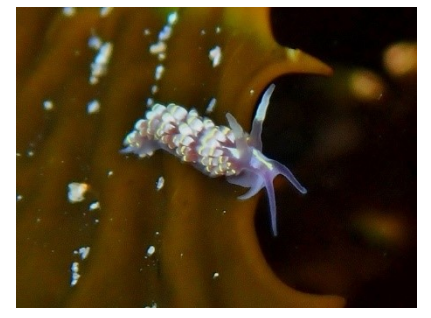
Facelina sp. RB2 (NS) (1 sighting)