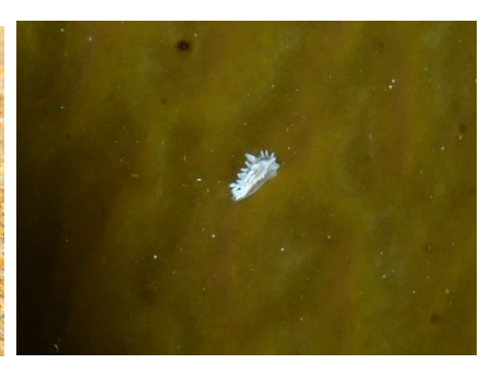
Okenia sp. RB3 (NS) (1 sighting)