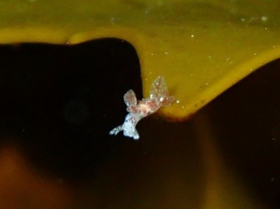
Hermaea evelinemarcusae (NS) (1 sighting)