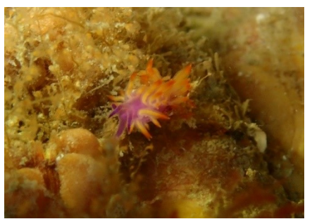
Flabellina sp. RB1 (NS) (1 sighting)