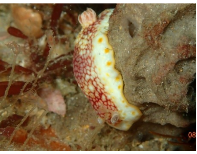
Goniobranchus tinctorius complex (KB) (1 sighting)