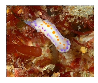
Thorunna perplexa (KB) (1 sighting)