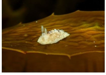
Doris cameroni (NS) (1 sighting)