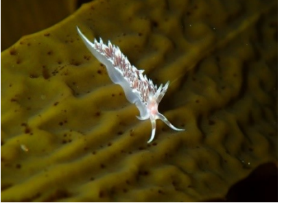
Facelina sp. RB3 (NS) (1 sighting)