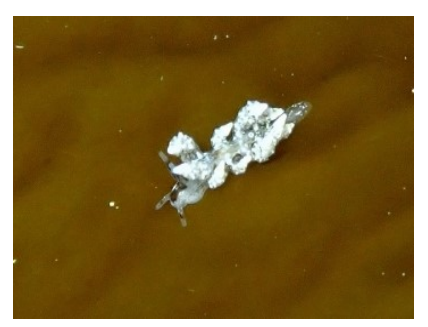
Eubranchus sp. (NS) (1 sighting)