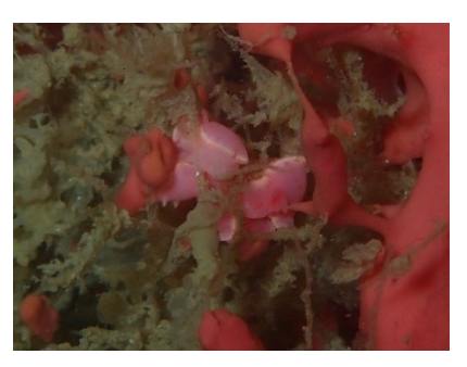
Verconia haliclona (NS) (1 sighting)