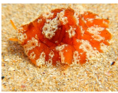
Lamellaria australis (JW) (1 sighting)