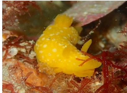
Doris chrysoderma (KB) (1 sighting)