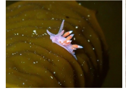
Flabellina poenicia (NS) (1 sighting)