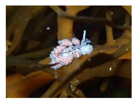
Doto ostenta (NS) (1 sighting)