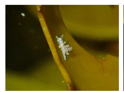
Hermaea sp. 1 (NS) (1 sighting)