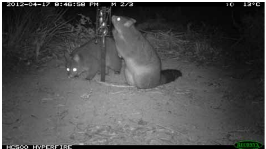
Mountain Brushtail Possums.