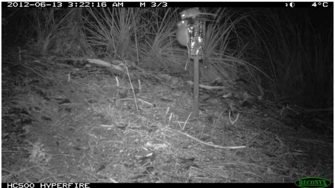
Antechinus and Bush Rat.

was positioned 50cm from the ground and aligned so that the bait station appeared in the horizontal centre of the frame and the bottom of the bait cage was in the vertical centre of the frame. The vegetation between the camera and bait station, and one metre behind was cleared within the field of view of the camera to ensure that this did not obscure any photographs of animals. The cameras were left to operate for a minimum of 21 days. Upon collection cameras were checked to see if they were still operating and this was noted.