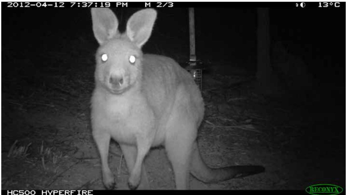
Eastern Grey Kangaroo.

Table 1 shows the number of sites in each category.