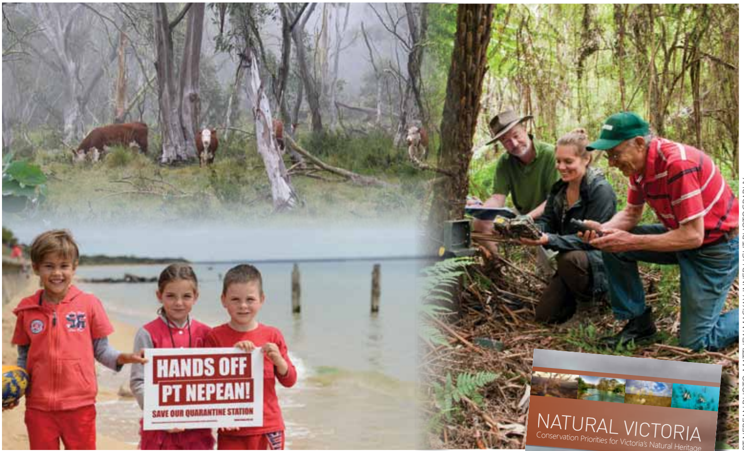
PT NEPEAN PHOTO: MATTHEW MACKAY, INNER LIGHT PHOTOGRAPHY; CATTLE PHOTO: PHIL INGAMIELLS; NATUREWATCH PHOTO: TRACEY KOPER, VCMC