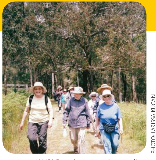
A VNPA Excursion group enjoys a walk on the Beechy Railtrail near Gellibrand.

We ran another popular Trivia Night in February, our annual Christmas and mid-year get-togethers, and Under 35 Social Nights - including a well-attended Under 35 Alumni dinner for those who can remember the good old days!