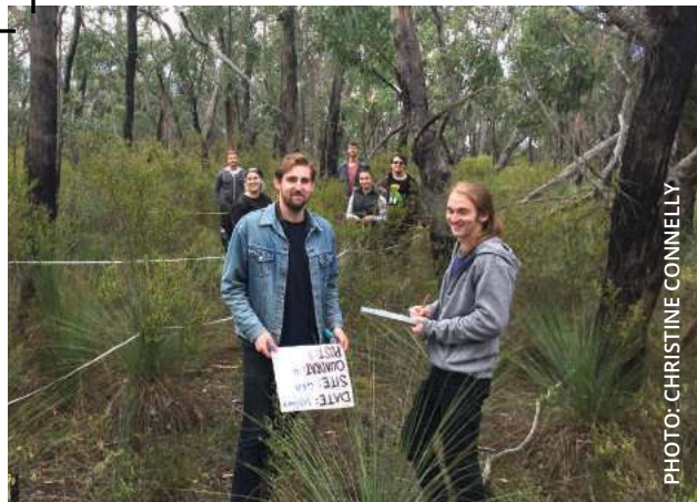
NatureWatch citizen-science in action.