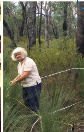
Our Wild Families program officially launched this year.